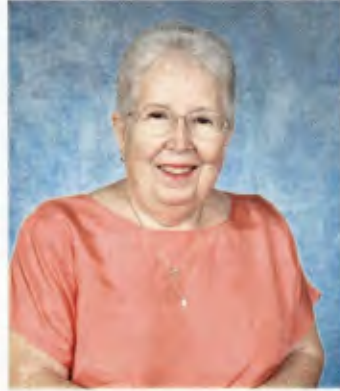
Hancock - Dee