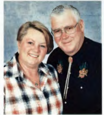
Lind - John & Jan #539 787-1894