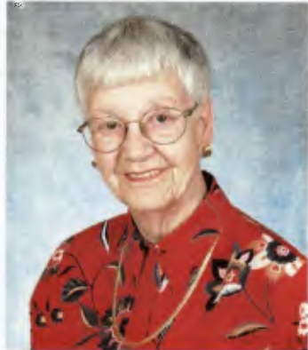
Walden - Hazel