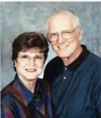
Glass - Juandell &