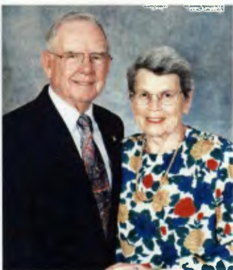
Linegar - Huey & Lucy #104 782-8627